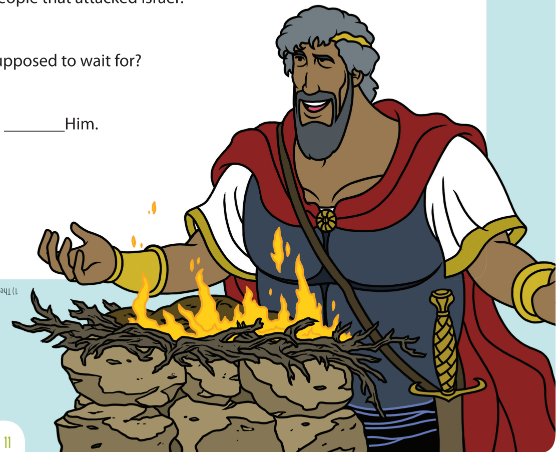
1) The Philistines. 2) Samuel. 3) Obey.