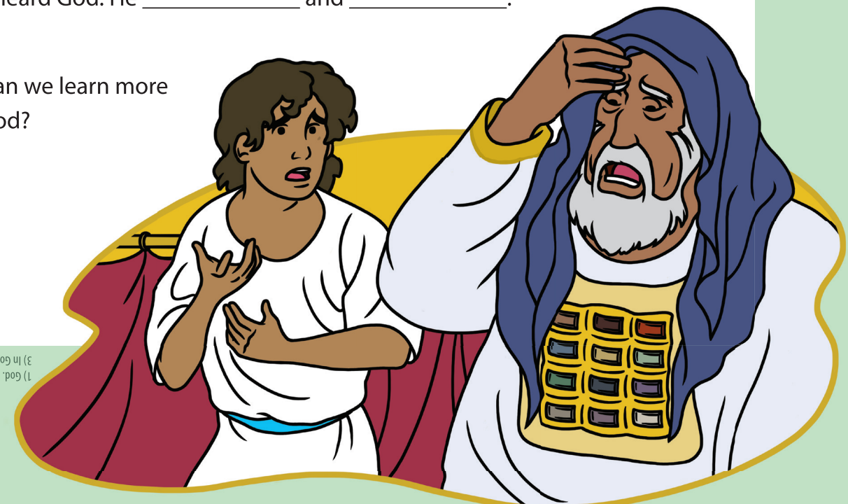
1) God. 2) Listened, obeyed. 3) In God's Word—the Bible!