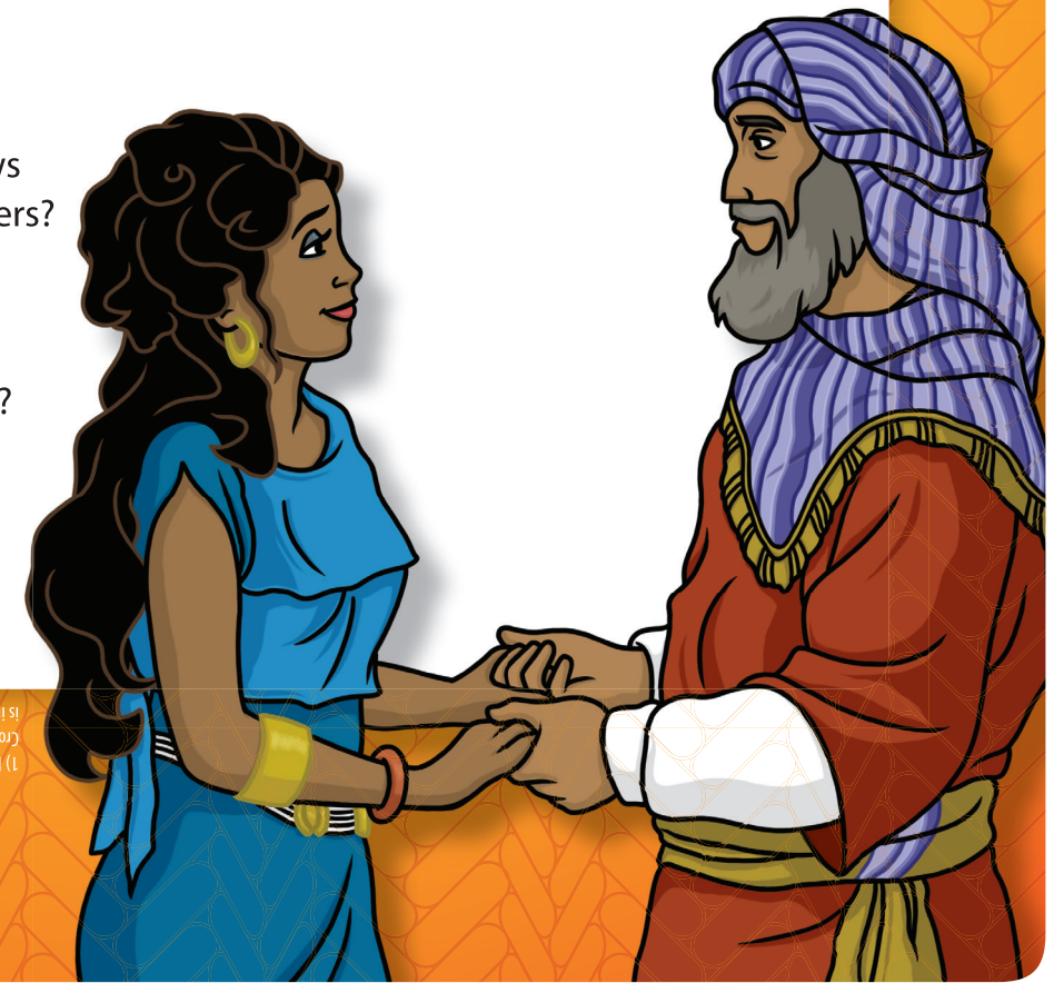
1) He married her and provided for her. 2) He died on the cross. 3) Ruth is King David's great-grandmother. Jesus is in King David's family.