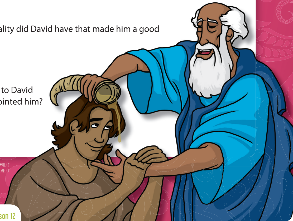
1) His appearance. 2) He had a heart for God. 3) The Spirit of the Lord came upon him.