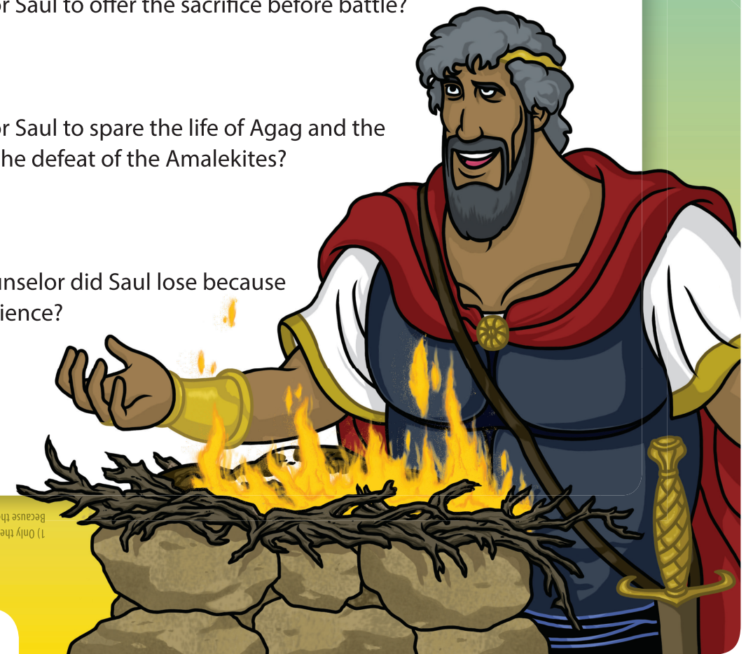
1) Only the priest could offer sacrifice to the Lord. 2) Because the Lord said to destroy them all. 3) Samuel.