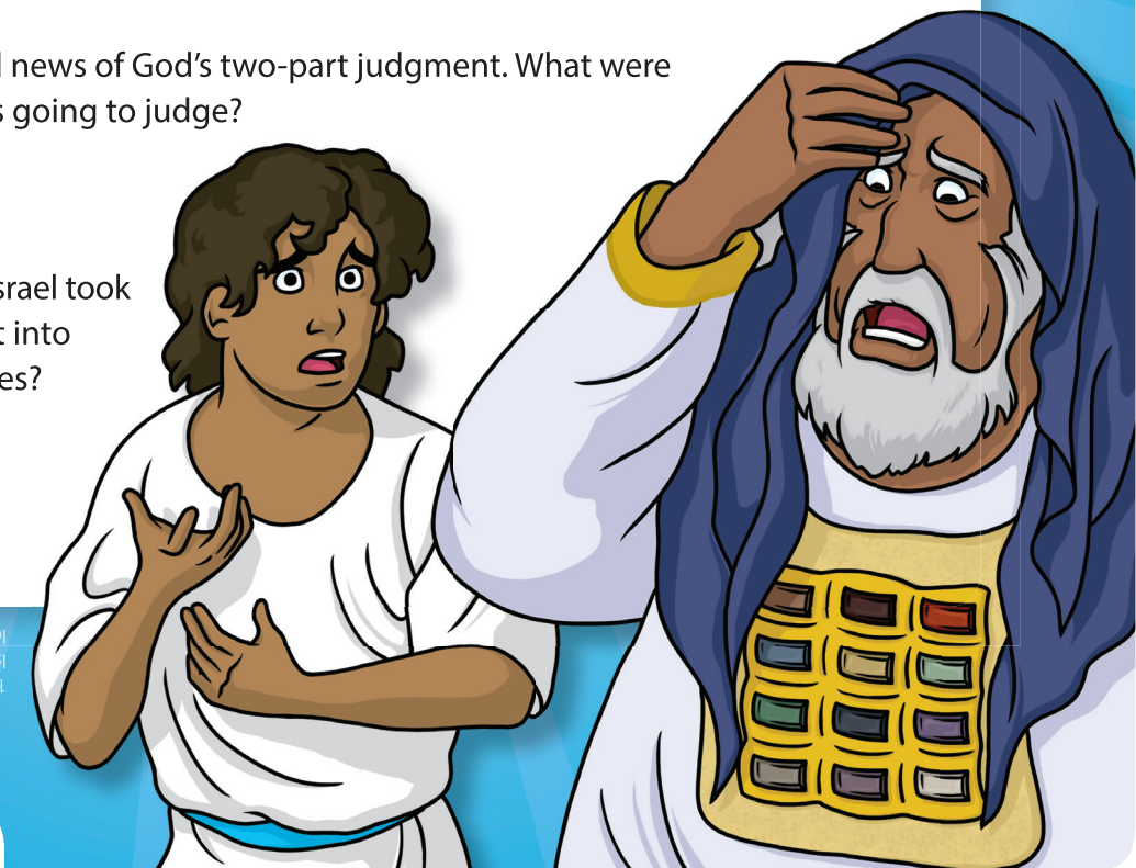
1) Because it was bad news of judgment. 2) The nation of Israel and Eli's whole family. 3) They were defeated and lost the Ark of the Covenant.