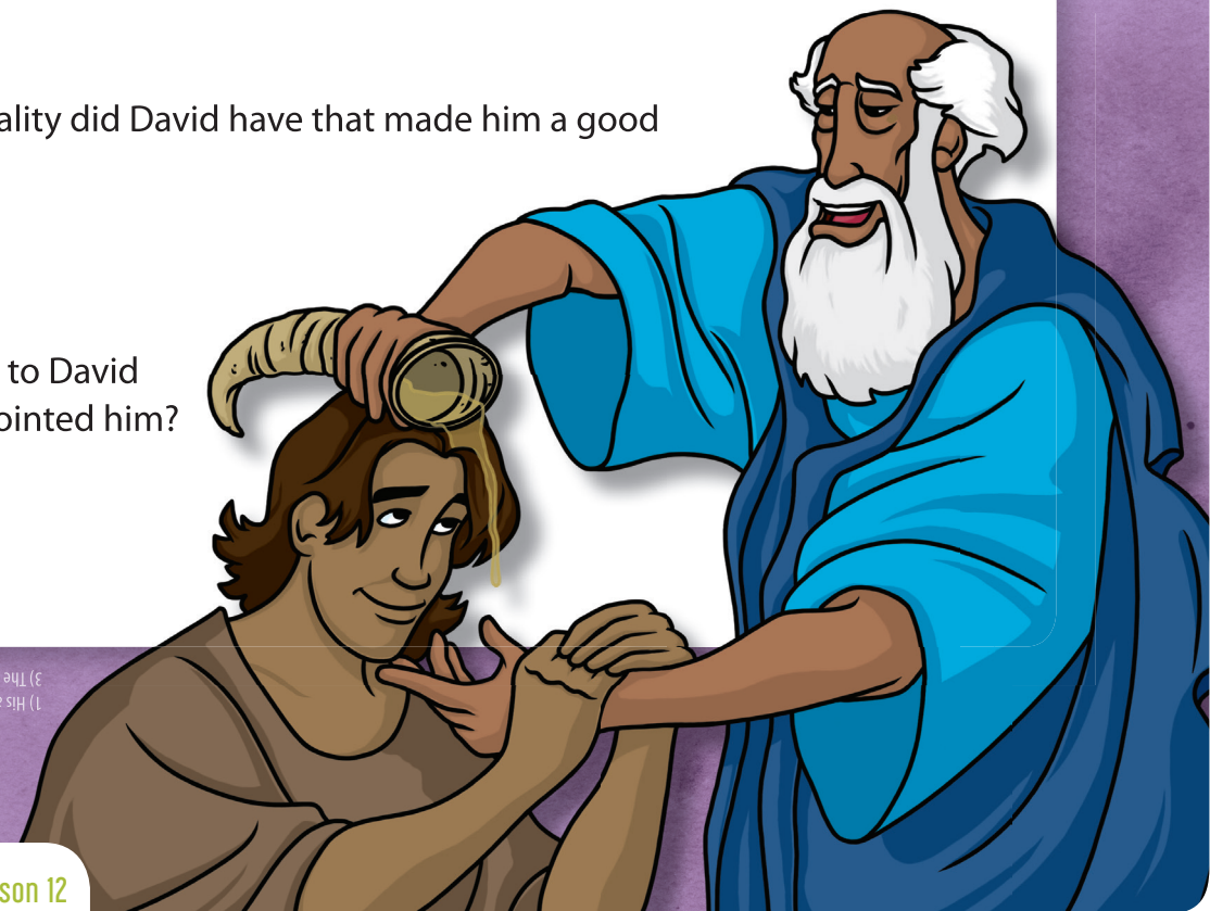
1) His appearance. 2) He had a heart for God. 3) The Spirit of the Lord came upon him.