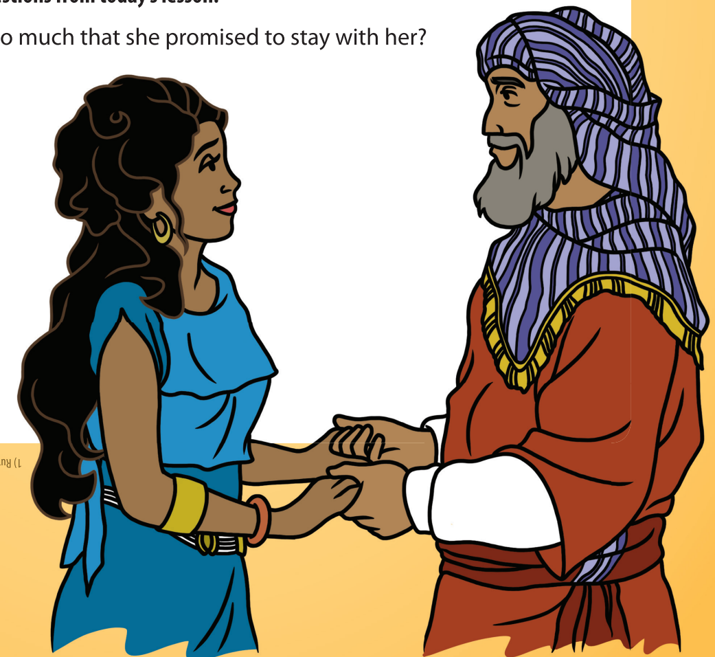
1) Ruth. 2) Boaz. 3) Jesus.